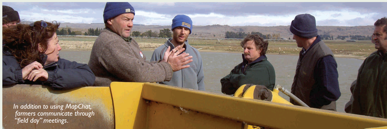
In addition to using MapChat, farmers communicate through "field day" meetings.

The aim is develop better relationships, smoother Resource Management Act processes, fairer community outcomes, improved environmental outcomes and, of course, a more efficient use of water.